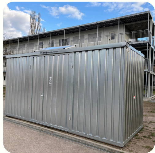
This container houses the break toys, because the old accommodation did not meet fire protection requirements

Although it's unclear how long the current schoolyard will remain, the Friends of the School Association aims to improve the school's break atmosphere, in addition to the mentoring project we featured in the last newsletter. A friendship bench in the schoolyard encourages social interaction and helps lonely students connect. A student sitting on the bench signals a willingness to talk, which reduces exclusion. The bench strengthens a sense of community and promotes a friendly school environment.